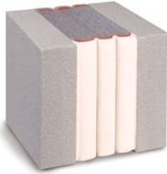
SecuritySeal SSW displayed in typical substrate.