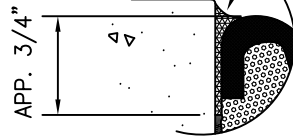
TYPICAL CORNER DETAIL NOT-TO-SCALE